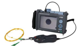
Connect PC/OTDR via USB